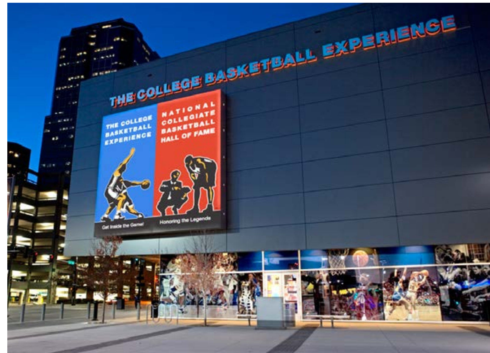
ESI designed dual logos and all environmental graphics for the College Basketball Experience.