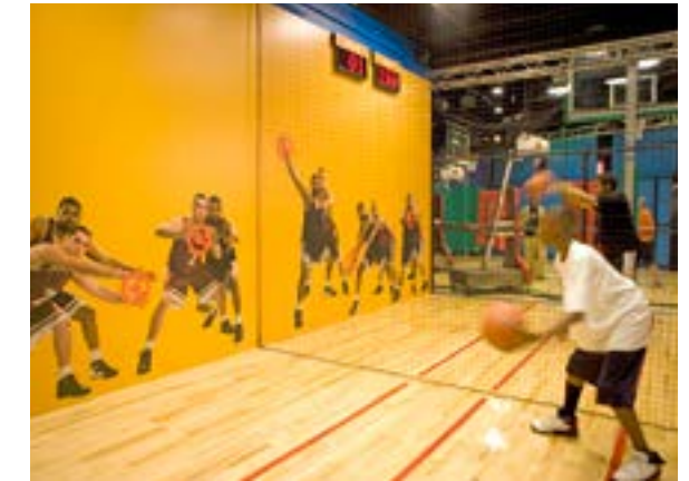
Left: Fans visiting the Mentor’s Circle.