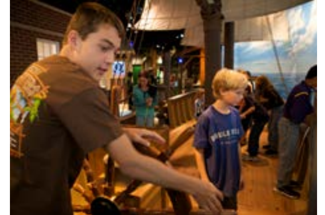
EXHIBIT SIZE: 14,000 Sq. Feet with Additional Site Elements SCOPE OF WORK: Master plan, exhibit design, multimedia and interactive design